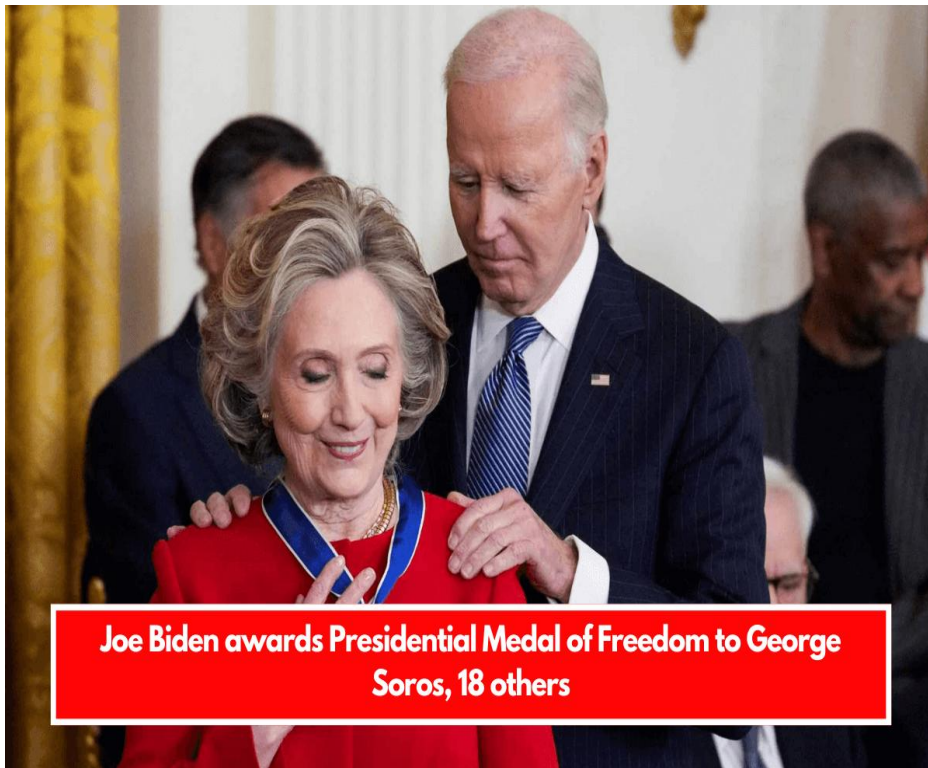
Joe Biden awards Presidential Medal of Freedom to George Soros, 18 others