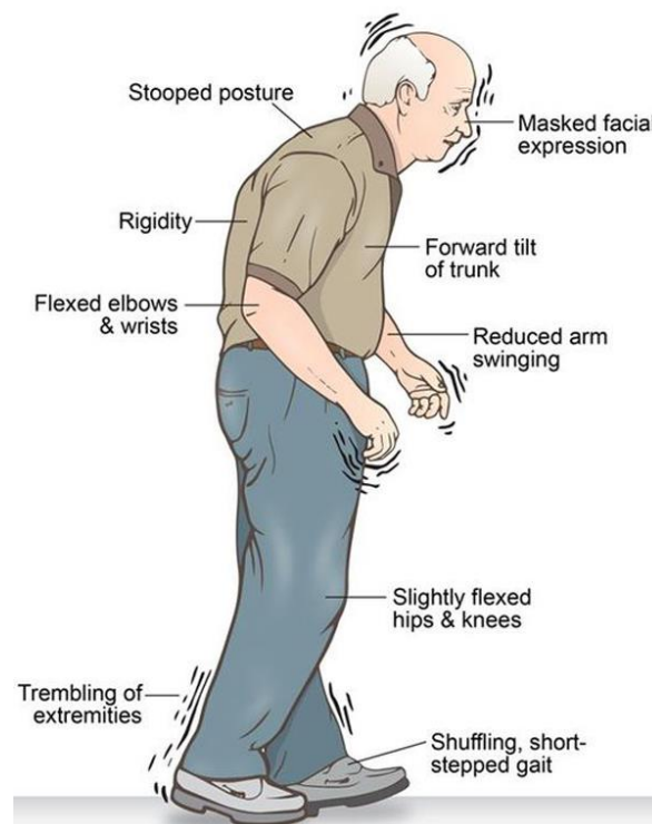
Typical appearance of Parkinson's disease